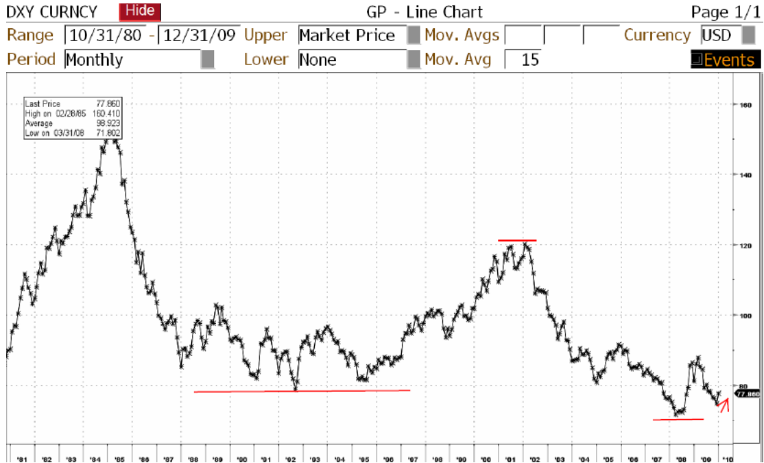
Graph 2. US Dollar Index, 1980 to Present

The other concern expressed by many investors is that the federal government's deficit spending is hurting our long term economic potential. That is a valid concern if the high deficit spending is sustained because interest expense will become a larger portion of the federal budget and will restrict the government's flexibility to address other spending needs. Compounded interest expense could become a significant drag on the federal budget. It does not represent an efficient use of the country's public capital. Fortunately, the fears of runaway deficit spending are already being felt in Washington. Members of Congress are proposing a new commission to deal with structural deficits and the Obama administration is signaling its concern with the deficits. Again, as the populace regains confidence in the economy, they will be more demanding of their Washington representatives to limit government spending. They will be less likely to ask Washington for help and protection like last year during the depths of the recession.